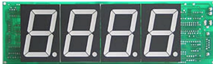
Figure 1: A Quad Seven-Segment Display

This lab practices logic design using familiar building blocks. From your previous coursework, you should already be familiar with simple counters, multiplexers, decoders, and seven-segment displays. The goal of this lab is for you to implement a circuit that drives the time-multiplexed quad seven-segment display present on the Digilent Basys3 board. When you successfully complete this lab, you will have developed a piece of intellectual property that you might be able to re-use in the future.